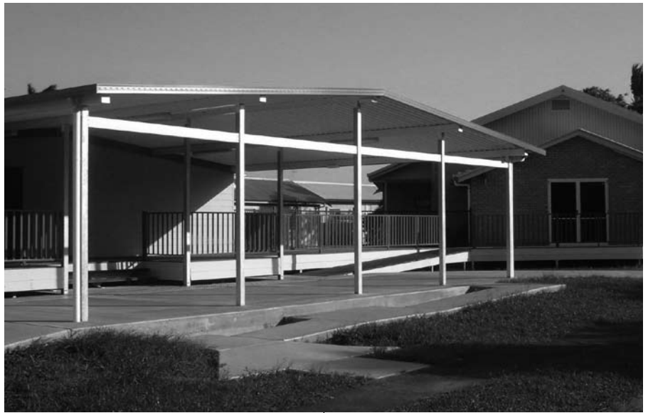
Iona's new church hall