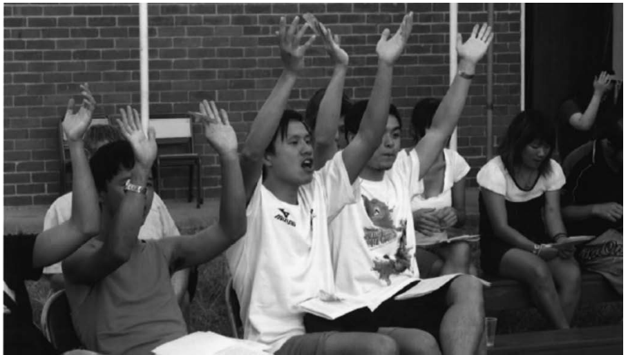
Music crossed cultural barriers.

tralia. Some of the town folk joined in too and the seed of the word of God was sown into many lives. The common language fortunately was English, but many had limited comprehension. We had to stretch ourselves to find appropriate ways to communicate that would be effective and help them to understand.