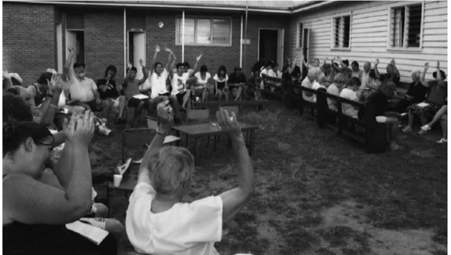
Outdoor worship at Merrigum

The visitors were from Korea, Taiwan, Hong Kong, Indonesia, India, Tonga, Fiji, England, France, Estonia, New Zealand and of course Aus-