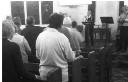
Gospel Central meeting at Kyabram.