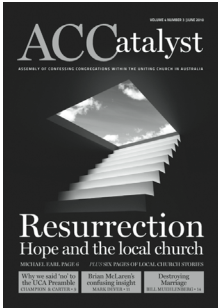
Cover illustration