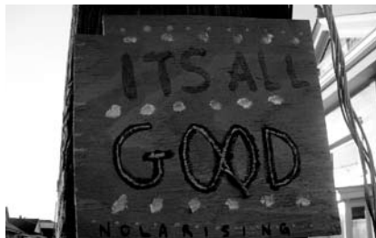
New Orleans 2007

Whilst at college being 'formed' for ministry, without doubt some of the most beneficial times were those spent with real-life practitioners who were already out on the coal-face. We would discuss potential (or real) pastoral issues that might pop up when we were eventually out in the messy world of congregational ministry. "It's all grace" is one of the 'take home' messages that has stuck with me from those interactions. It has come in handy in all manner of ministry situations that I have found myself in.